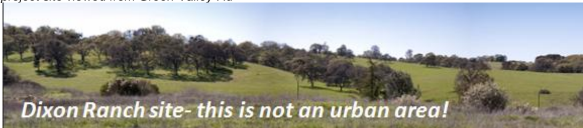
project site viewed from Green Valley Rd