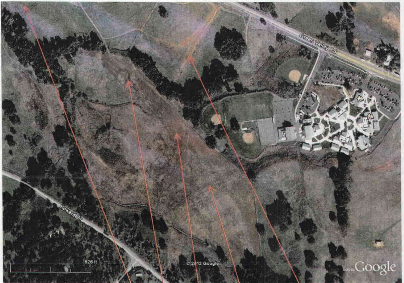
Enclosure #3 2011 October 30 Approximate Unauthorized discharge of Fill Material.